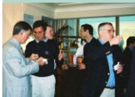
"Good times, good food, good drink and good company is what we're all about tonight."