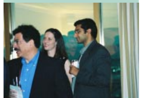
"Do you think they having a better time than we are? Should we go join them?"